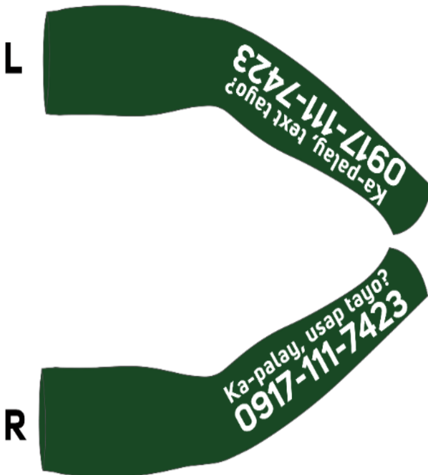
Item no. 1 (Arm sleeve cover)