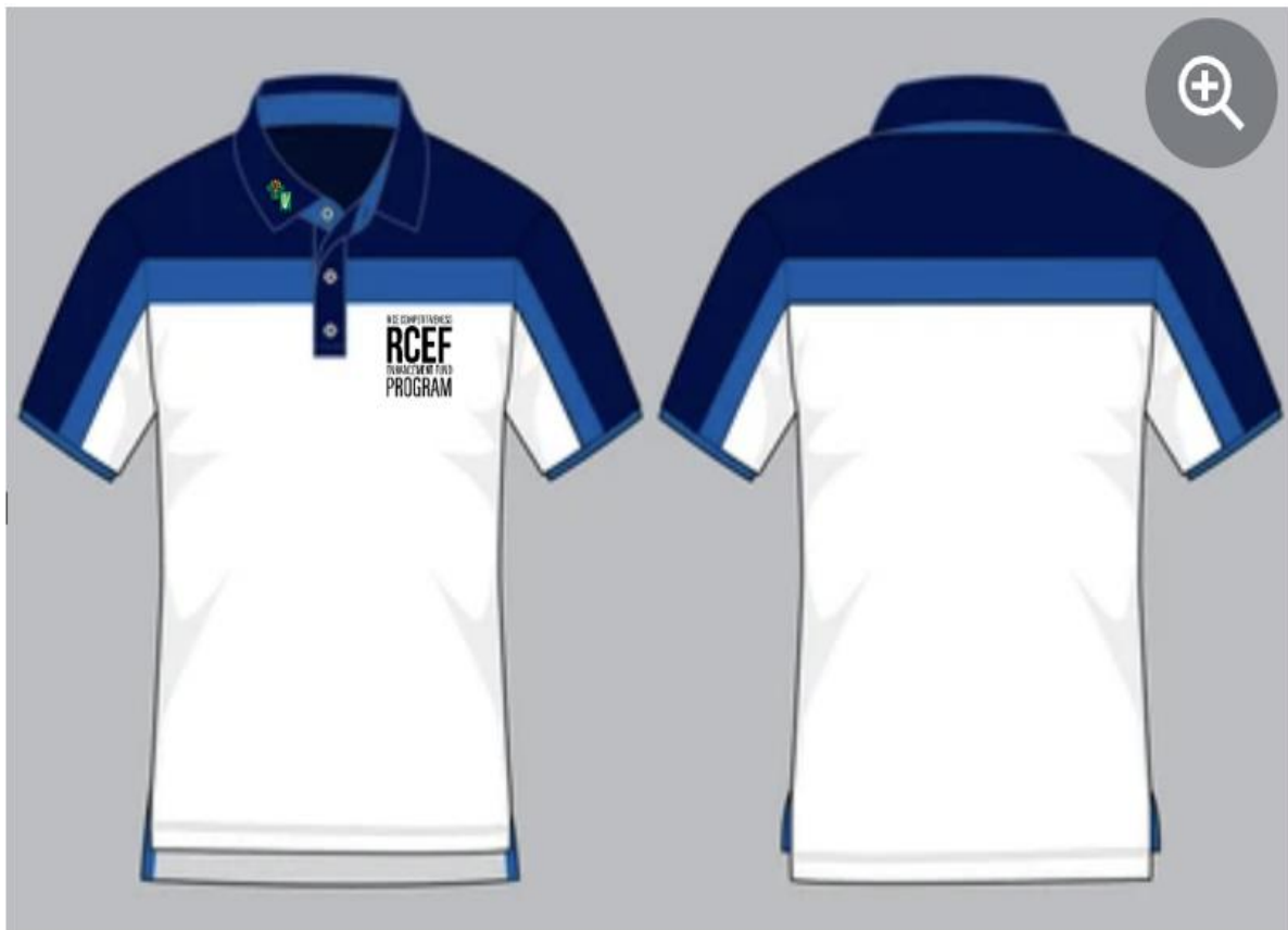
Item no. 5 (Knowledge Product (PTC Hand-out))