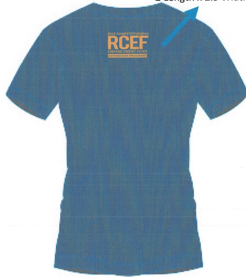
TOT - TSHIRT