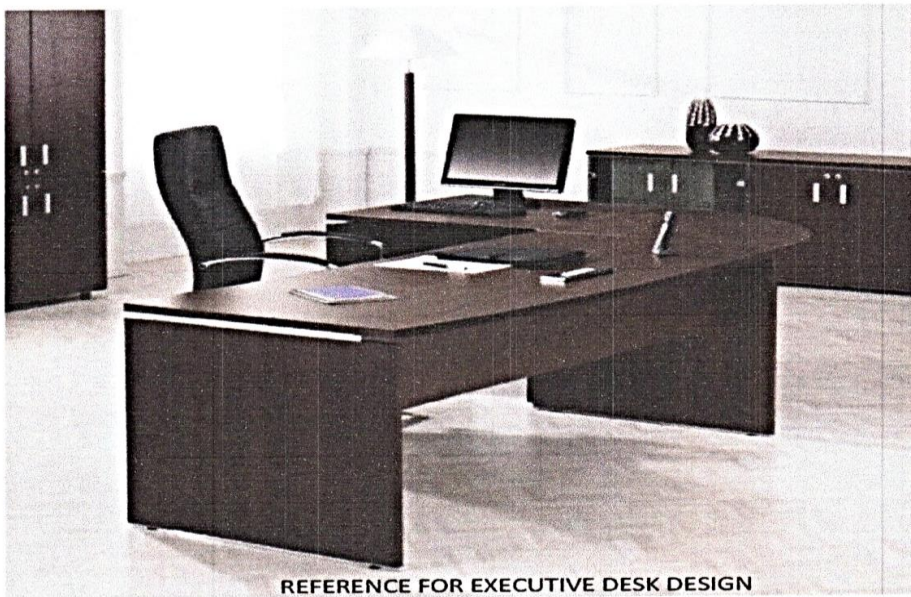
REFERENCE FOR EXECUTIVE DESK DESIGN