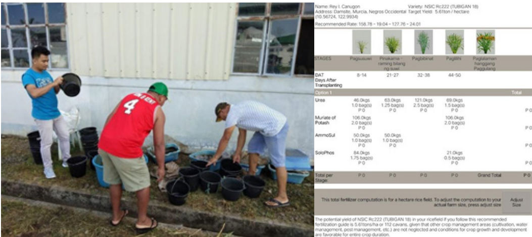
A MOET set-up was conducted and introduced to the partner-farmers

This study aimed to increase the utilization of high-quality seeds (HQS) in Regions VI and VII through benchmarking on the rice seed systems, enhancing the capacity of selected farmers to produce HQS, and updating seed growers with the new technology in seed production. For 2019 WS, a 1.10-ha technology demonstration cum seed production was established in the farmer-cooperator's rice farm. NSIC Rc 222 foundation seeds were used as planting material. The farmer-cooperator was introduced to a package of seed production technology including HQS seeds, chemical inputs, technical assistance, and labor. A modified farmer field school was also conducted with invited local farmers to promote PalayCheck System and recent updates on seed production. Leaf Color Chart and Minus-One Element Technique (MOET) Kit were introduced to the farmer-partners. AESA was also regularly conducted to teach farmers on integrated pest management (IPM). A field walk was conducted to showcase the package of technology in the techno demo area. A 1-ton yield increase was gained from the fresh yield. The produce was intended for seed so the price was not significantly affected. The cooperator profited P55,000 gross income.