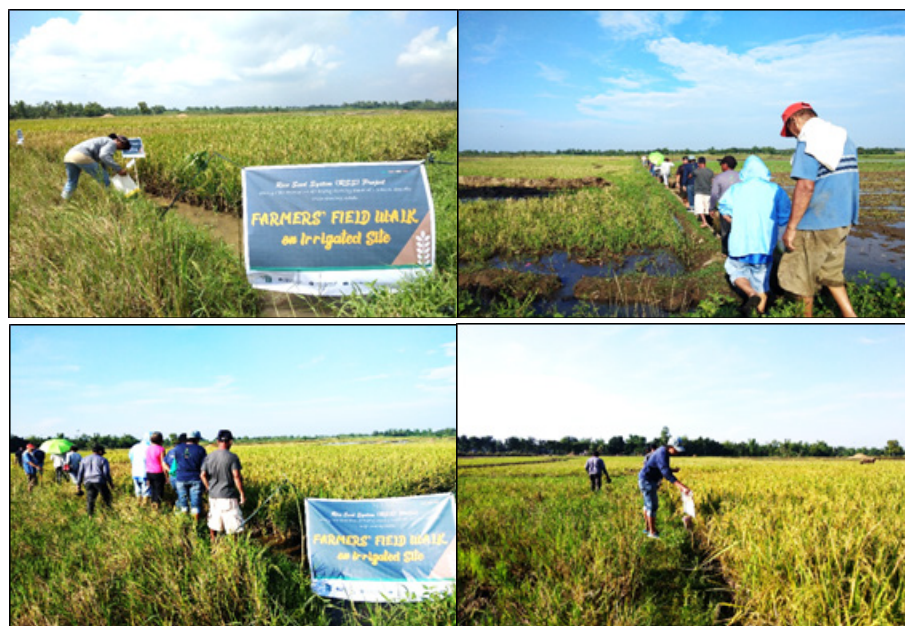
Participatory varietal selection (PVS/Field Walk) in RSS irrigated site