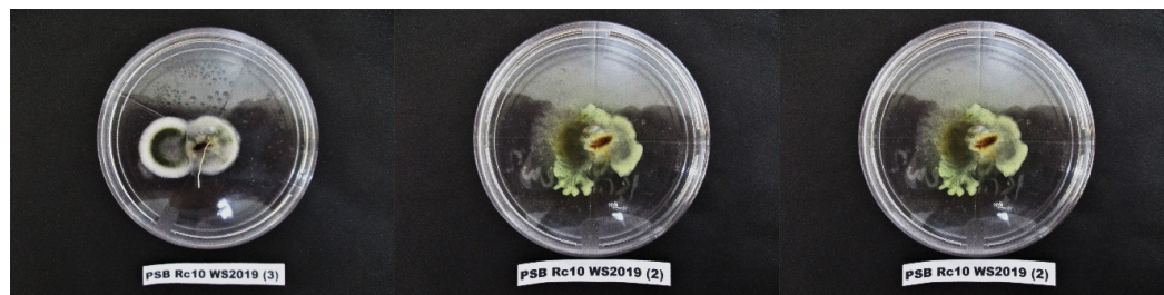
Trial isolation test conducted on individual discolored seeds of PSB Rc10 harvested in WS2019