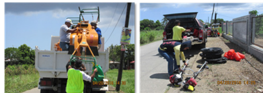
Figure 8. Delivery of farm machinery to IA beneficiaries.

machineries are being scheduled for delivery.