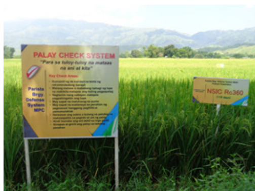
Figure 6. Field demonstration of inbred rice varieties.