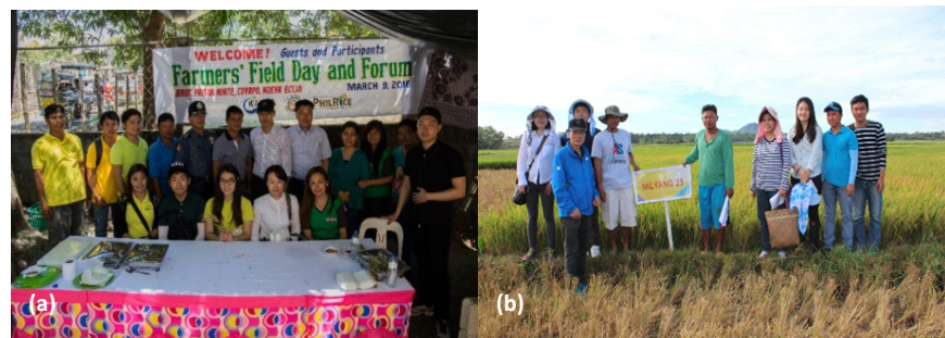
Figure 13. Activities conducted: (a) Farmers' Field day in Brgy. Paitan Norte, Cuyapo, Nueva Ecija and (b) Field visit with Dr. Kim Sang Hwa.