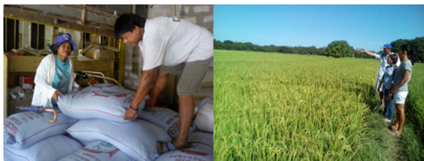
Figure 7. Activities conducted: (a) Distribution of certified seeds to farmer-cooperators and (b) Field monitoring and evaluation.