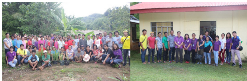
Figure 5. Beneficiaries (left) and Project Implementers (right) of the newly-developed DSWD-PhilRice-LGU Mabini Collaborative Project on “Pagsasanay sa Produksiyon ng Palay at iba pang Pangkabuhayan” or 4Ps training.