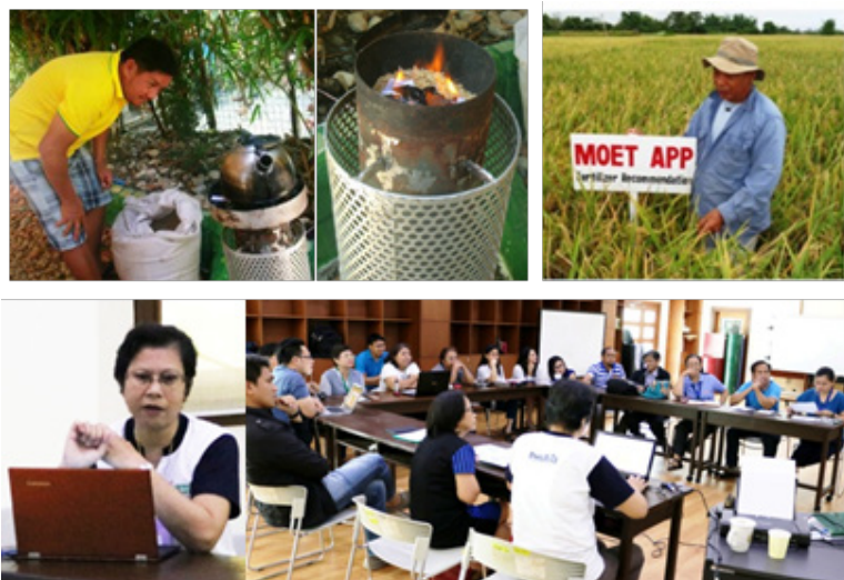
Figure 4. (a) Multi-location field validation of MOET App; (b) Field validation of RHGS in Nueva Ecija; and (c) Brainstorming/workshop for manual completion.