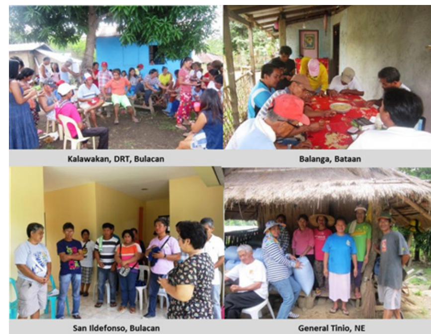
Figure 12. Training and organization of upland farmers.