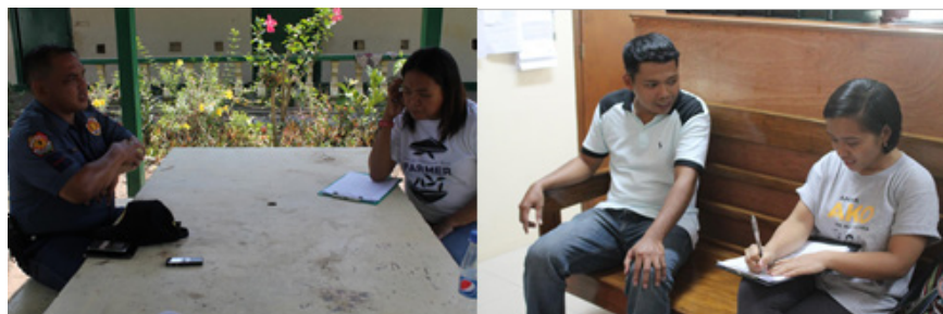
Figure 3. On-site interviews in La Union and Aurora.