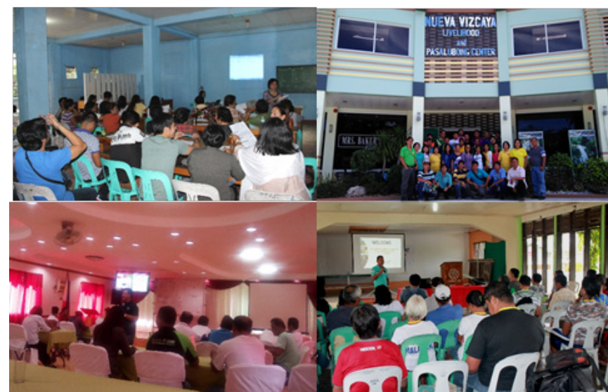
Figure 1. Conduct of specialized training courses in: (a) Nueva Ecija; (b) Nueva Vizcaya; (c) Romblon; and (d) Quezon.