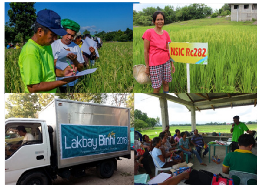
Figure 12. Activities conducted: (a) Farmers' Field day and Forum; (b) Techno-demo field; (c) Lakbay Binhi; and (d) Farmers Field School.