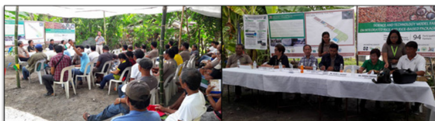
Figure 10. Conduct of training: (a) Training on “Sustainable Vegetable Production and Marketing”; and (b) Rice-Fish Technology and Tilapia Culture.