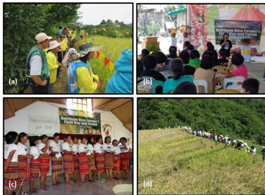
Figure 11. Heirloom Rice Farmers' Field Day and Forum in: (a) Mountain Province; (b) Ifugao; (c) Kalinga; and (d) Benguet.