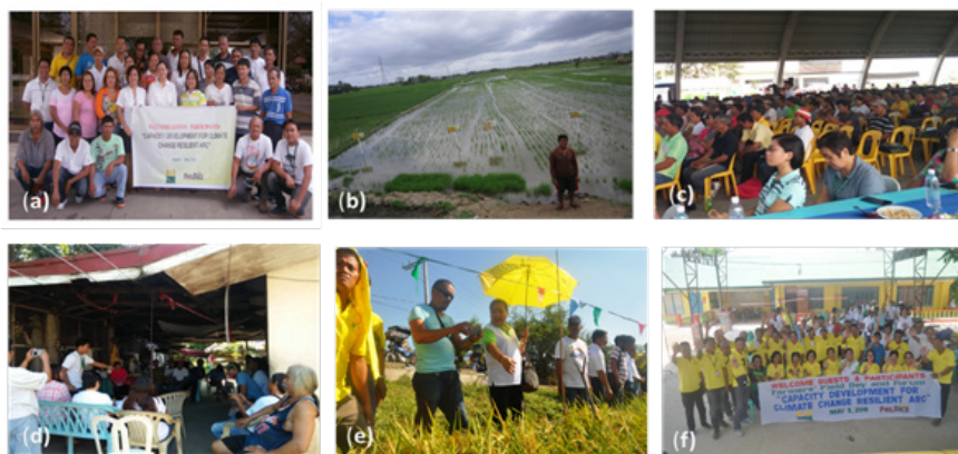
Figure 25. Activities conducted: (a) Training; (b) Techno Demo; (c) Agri-kwentuhan; (d) Field Tour to PhilRice; (e) Farmers’ Field Day and Forum; and (f) Group picture.