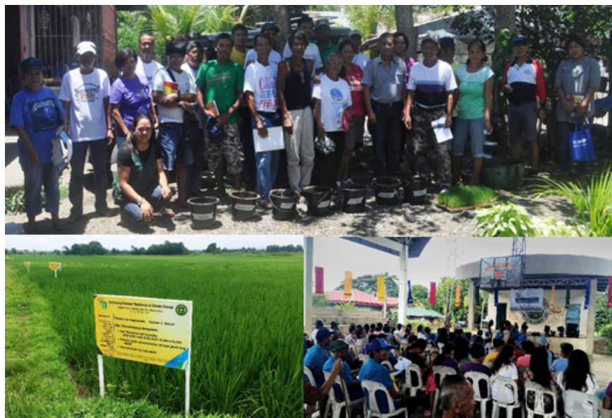
Figure 2. (a) Climate Change Game-based FFS farmer-participants in Kali-kid Norte, Cabanatuan City; (b) Participatory Techno-demo of different rice varieties for Climate Change; and (c) Farmer's Field Day attended by 127 farmers and AEWs held on October 4, 2016.