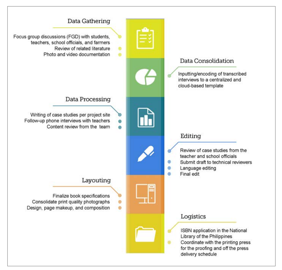
Figure 1. Data collection and book-writing

Data and details in this book came from the numerous interviews and FGDs conducted during project implementation, and visits to the schools for monitoring purposes. All interviews and FGDs were audio-recorded and transcribed. During the monitoring, we also took the time to scour the surrounding community to help us better understand the development context.