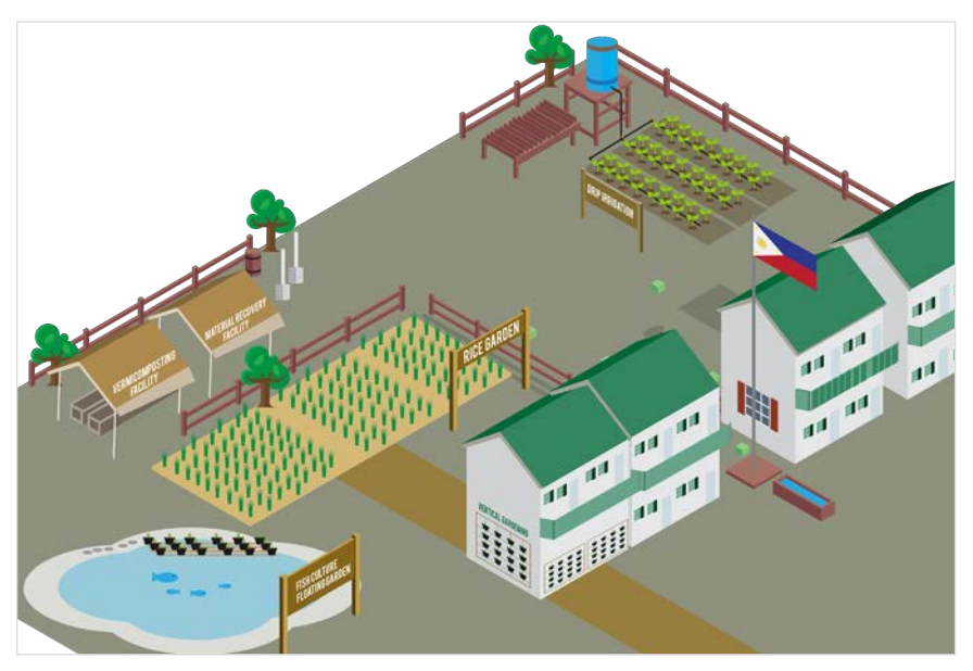
Figure 2: Starter kit for strategies/technologies for CCA in rice-farming communities.

As we have seen in almost all of our sites, the school setup has always sparked conversations on why certain practices are done. In hindsight, the setup hits two birds with one stone: the school is able to promote certain technologies and simultaneously talk about CCA. Through relevant technologies, a school can connect with its surrounding community. The logic is that there has to be a reason a farmer would turn up in a school. Remember that the school is not a usual destination for farmers. There has to be a good reason a busy farmer would go out of his/her way to check the setup in the school.