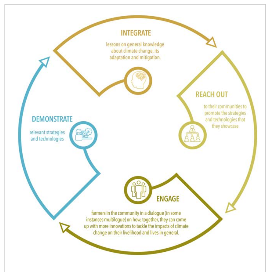
Figure 3: Characteristics of a CC-A school.

To close this book, we would like to respond to our main question: What is a climate change-adaptive school? If you have read this book right from the start, chances are you already have your own answers. Based on the cases and elaborations that we already provided, you are now in a privileged position to take implementation to the next level. That is actually the intention of this book: to lay down basic concepts and invite innovations from there. To level-off expectations and to ensure that we are on the same page, CC-A schools are schools that: