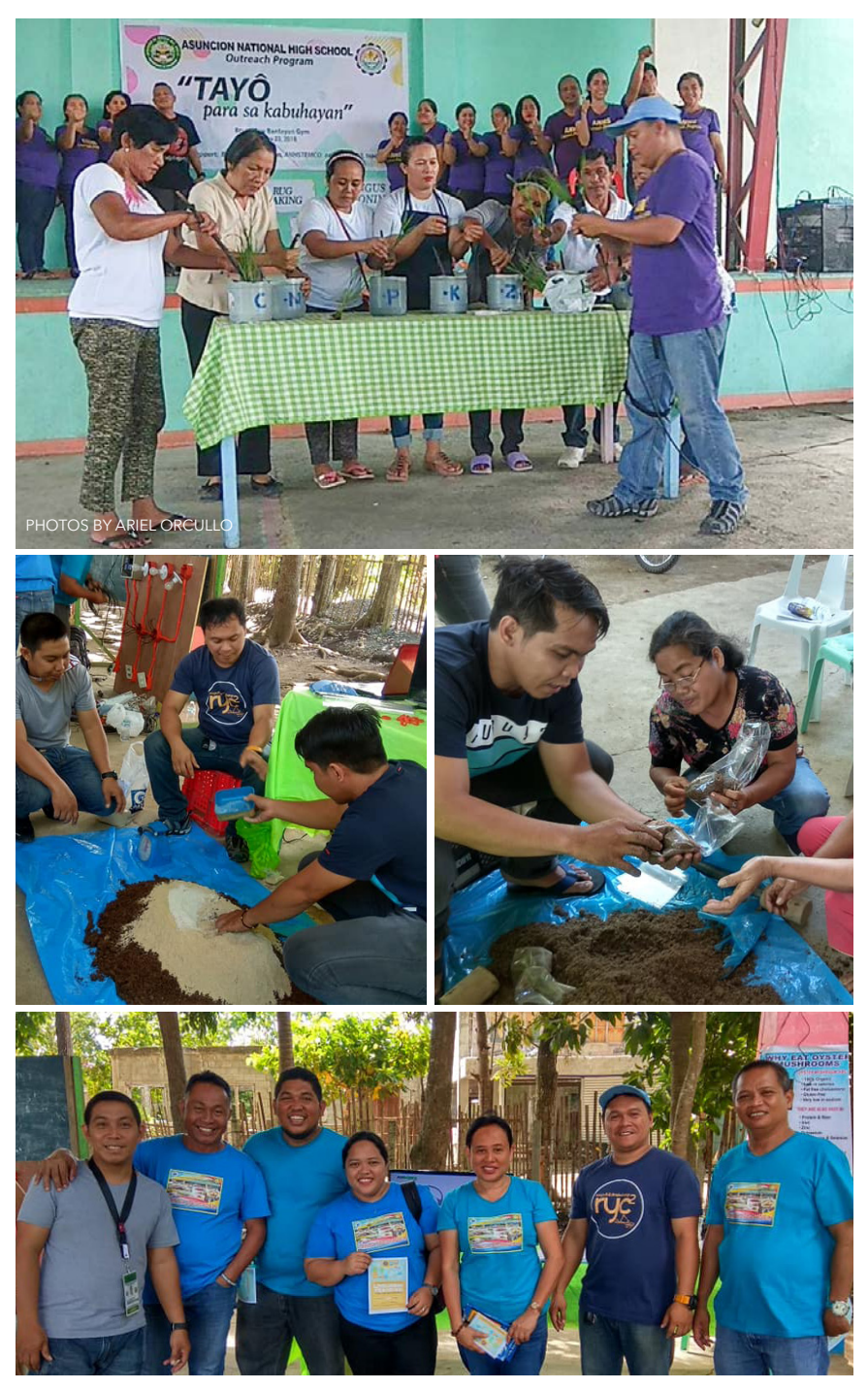
Techno-demo of Minus-One-Element Technique (MOET) and Oyster Mushroom production during the school's outreach program.