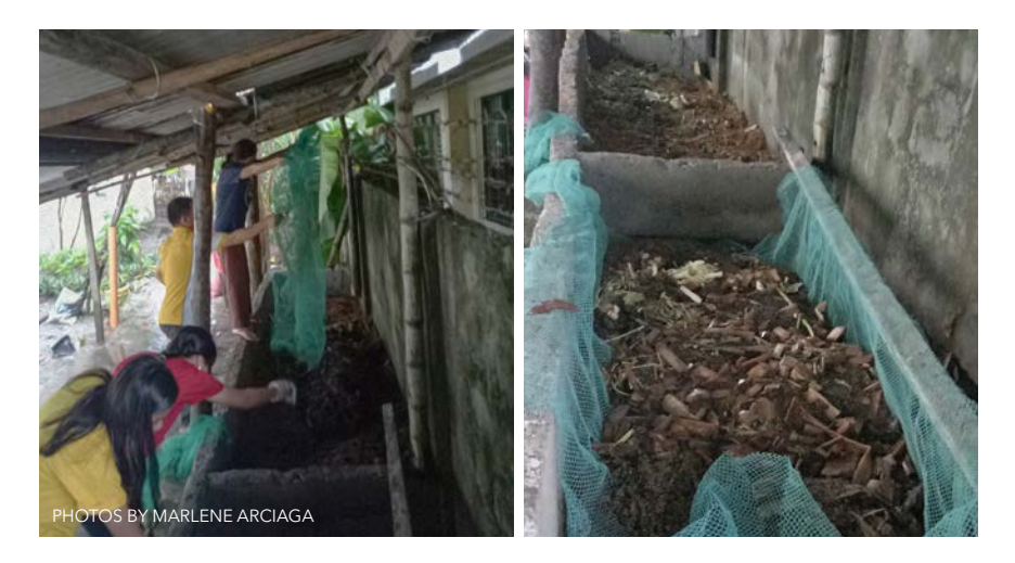
Vermiculture . This component started with a kilogram of African Night Crawlers bought from a farm in Bamban, Tarlac. As of this writing, the school has three beds (1x5x3m) for vermiculture.