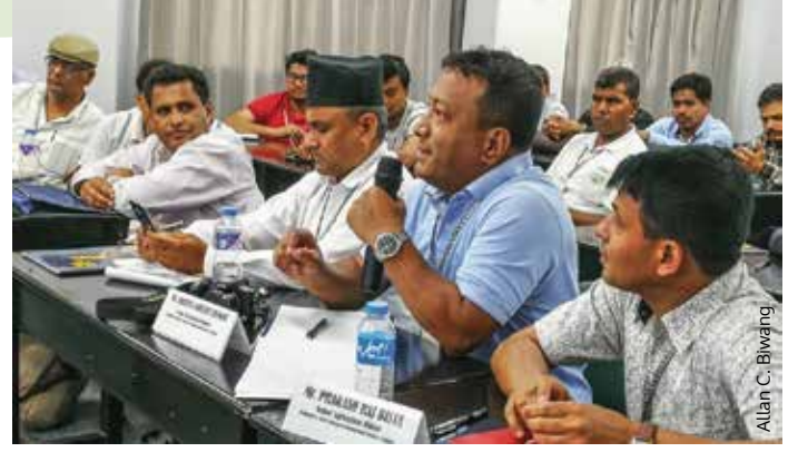
NEPAL OFFICIALS VISIT PHILRICE. The Ministry of Agriculture personnel, June 19, learned about new rice farming technologies. The Asia-Pacific Rural and Agricultural Credit Association Center for Training and Research in Agricultural Banking based in Manila facilitated their educational tour.